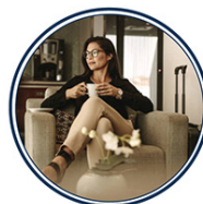
Taking on Travel Risk Management