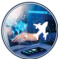
Structuring a Managed Travel Program

This free, self-guided education series was developed for all expertise levels providing foundational knowledge for those new to the business and more granular topics for seasoned vets looking to strengthen their skill set. You'll have the flexibility to pick and choose the course(s) of most relevance to you and your travel program.