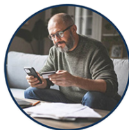
Selecting a Travel Payment Provider