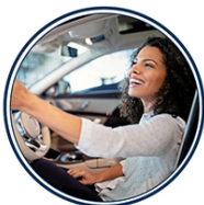
Working with Car Rental Companies