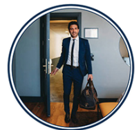
Setting Up a Corporate Lodging Program