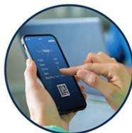
Selecting an Online Booking Tool