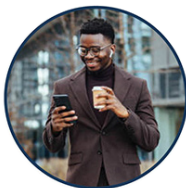
Establishing a T&E Policy