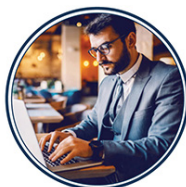
Selecting an Expense Management Solution